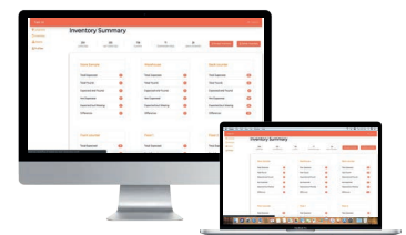
User-friendly Backoffice and Dashboard