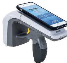
RFID Reader + Mobile Device